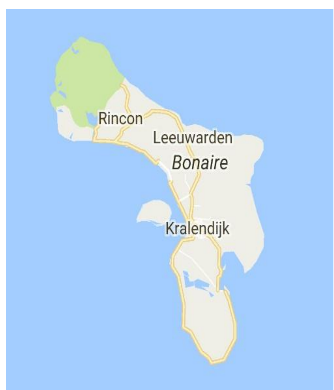
Figure 1. Map of Bonaire.

The blooms are difficult to predict, both with respect to time and location of appearance and with respect to the amounts of biomass that would land on the coasts. Therefore, it is difficult to define value chains based exclusively on sargassum biomass. In a recent study 1 , strategies have been described to co-process sargassum together with organic residues in the context of the Dutch Caribbean islands. These strategies are developed further in Bonaire (Fig. 1,2) as case study.