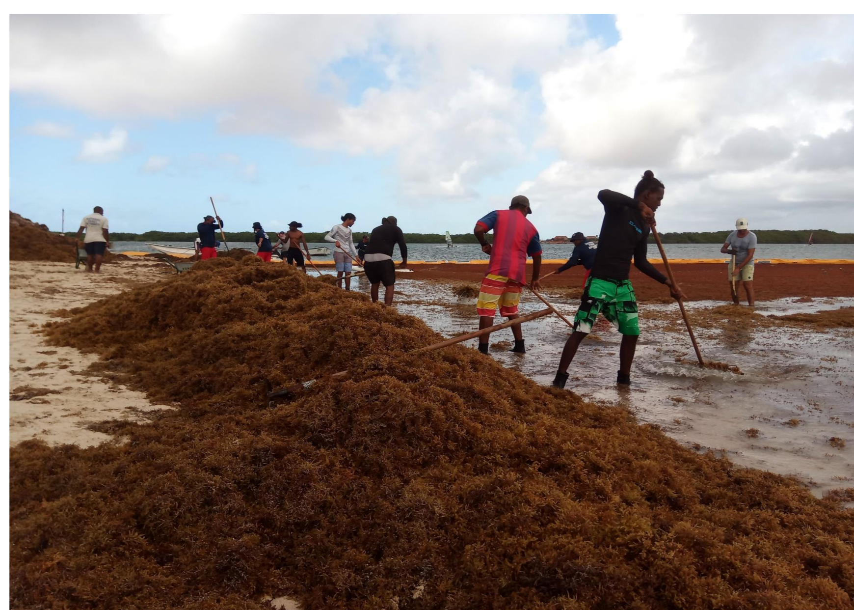
Figure 2. Cleaning of Sargassum on sand in Bonaire.